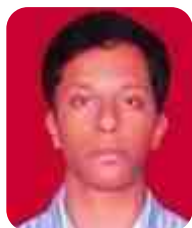
15951A0520 - CSE CH ARYABHATTA