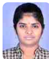
15951A04C1 - ECE M PRATIBHA