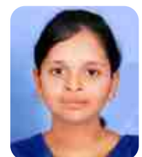
15951A1246 - IT PABBATHI SRJANA