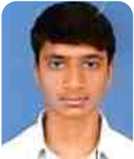
15951A0529 - CSE N CHANAKYA