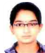
15951A05H5 - CSE V SHRUTHI