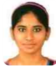
15951A0499 - ECE T NAVYA