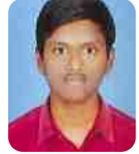
16955A0428 - ECE B KALYAN