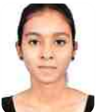
15951A05J1 - CSE P SPOORTHI