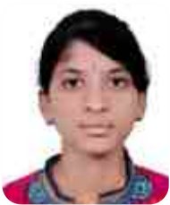
15951A1231 - IT P SAHITHI