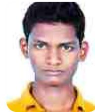
15951A05G7 - CSE MIRALA SHIVA