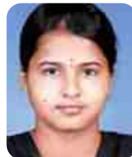
15951A0388 - MECH THURPU THANMAI