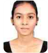
15951A05J1 - CSE PIDATALA SPOORTHI