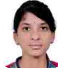
15951A1231 - IT P SAHITHI