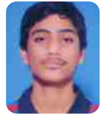
15951A0485 - ECE B LOHIT