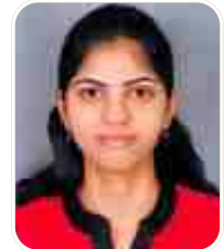
15951A0516 - CSE PUNDRA APOORVA