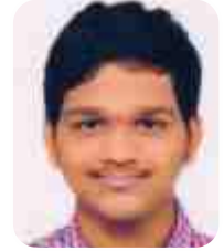
15951A04E7 - ECE A SAI CHAITANYA