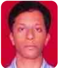
15951A0520 - CSE CH ARYABHATTA