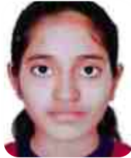
15951A0563 - CSE V KRISHNA SRI