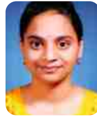
15951A04J9 - EEE N SRI VAISHNAVI