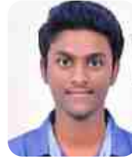
15951A0436 - ECE CH DHANDEEP