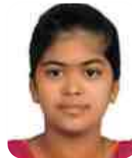
15951A0591 - CSE GEEREDDY NEHA