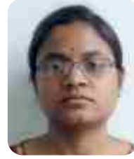
15951A04A7 - ECE KOLLI PADMA SREE