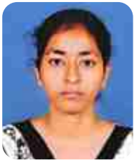
15951A1250 - IT M UDAYSRI